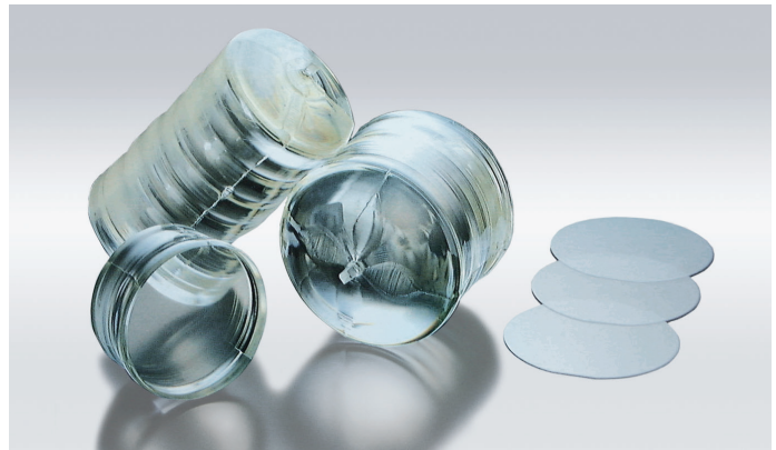
Sapphire crystal boule produced from crystal growing process.

H.C. Starck Solutions produces crucibles for the Heat Exchanger Method (HEM) using spin forming. During crystal growth via HEM, the temperature required for melting the alumina crackle is held constant and when the thermal stress affecting the crucible is low, thin-wall spun molybdenum crucibles can be used. In other methods such as Kyropoulous, the thermal gradient is quite severe and requires thicker-walled crucibles made from molybdenum, molybdenum alloys or tungsten.