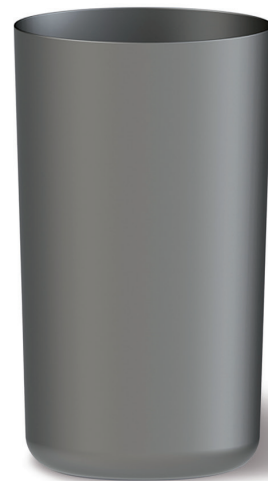
Molybdenum spun crucible output.